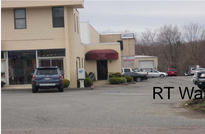
Red Tomato Warehouse